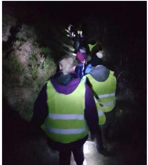
Night hike on the slippery slopes of Sugar Loaf 'mountain'.

The Cubs have taken part in many activities over the past year, including hikes around different parts of Folkestone – taking in the beautiful coastline to the heights of the Downs.