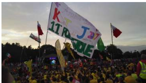
11th Folkestone @ KIJ17 closing ceremony

Climbing, sailing, rifle shooting, archery, wood turning, circus skills and 4x4 driving were just a few of the things our young people had the opportunity to experience when we attended KIJ 17 at the Kent County showground. 21 young people and 10 adults from our group spent 8 days in the company of over 6000 other scouts from across the world.