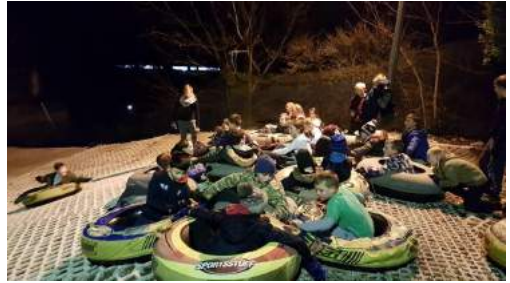
Tobogganing on a cold wintery night.

The rest of the term consisted of many outdoor activities, even on the dark and wet nights, ending with an investiture on a moving toboggan! The first for Bagheera.