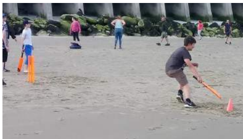
Beach games at Sunny Sands.

We have enjoyed going out and about in the local area including games on the beach, hikes down the Warren, camping in Canterbury and most recently a ramble through Reinden wood with the company of Hawkinge Scout Troop.