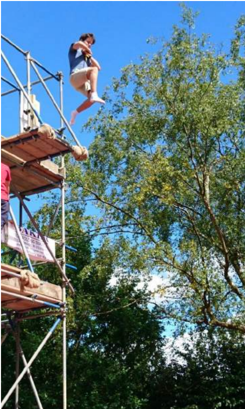
KIJ 'Bag Jump' (don't worry, there is a big air bag right under him!)

The Explorers attended the Kent International Jamboree in August with the Scout Section and had the opportunity to try many new activities.