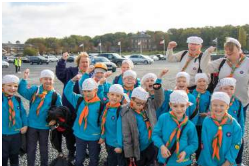
Beaver Pirates arriving at Ahoy!

We have been involved with several activities at District Level including the annual picnic in Lyminge where the theme was 'Cowboys and Indians'; a visit to Chatham Dockyard with the theme of 'Pirates' and a Christmas themed sleepover hosted by 11 th Folkestone where forty Beavers got to fulfil the Beaver motto of 'fun and friendship'. We also attended the Remembrance Day parade on the Leas and despite the small explosion remained in place (and safe), if a bit chilly.