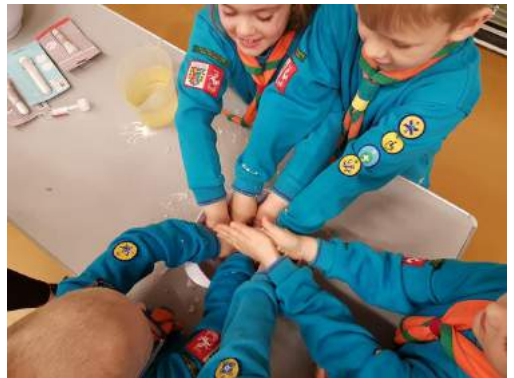
Teamwork, experiments and a bit of mess.

Our most recently awarded badges have been for Space, Experiments and the Teamwork Challenge award.